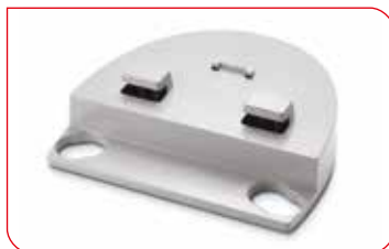
The seca 437 adapter element connects the stadiometer to a flat scale.