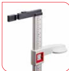
The spacer provides extra stability and ensures precise measurement results.