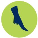
Conforms to Body