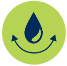
Water Proof Dressing